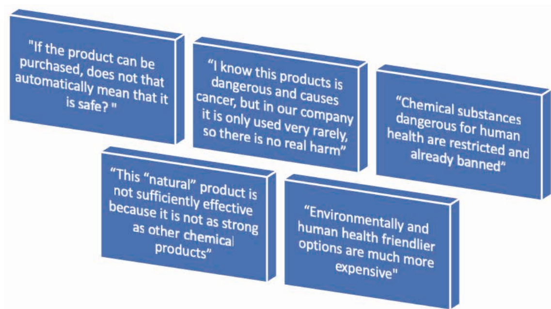
Figure 1: misconceptions on chemicals risk management

Some myths on chemical product use hindering any change of behaviour are deeply rooted at different business sectors, particularly among hairdressers and users of cleaning products. The following figure presents the essence of these misconceptions.